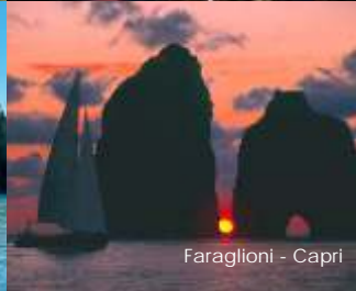
Faraglioni - Capri