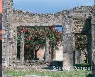
Scavi di Pompei