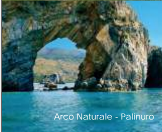
Arco Naturale - Palinuro