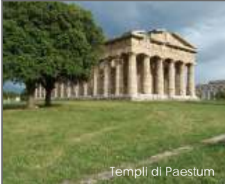
Templi di Paestum

Mediterraneo camping is located only a few miles away from sightseeing tour like Salerno, Paestum with its famous Greek temples and so on.